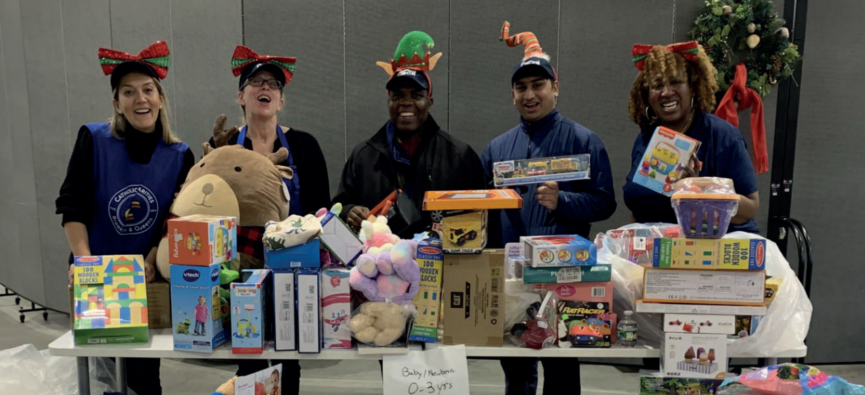
Volunteers from Long Island Board of Realtors at 2024 Christmas Toy Drive

and Queens are tax-deductible to the fullest extent allowed by law. Year-end giving can help reduce your 2025 tax burden while creating positive change in our communities.