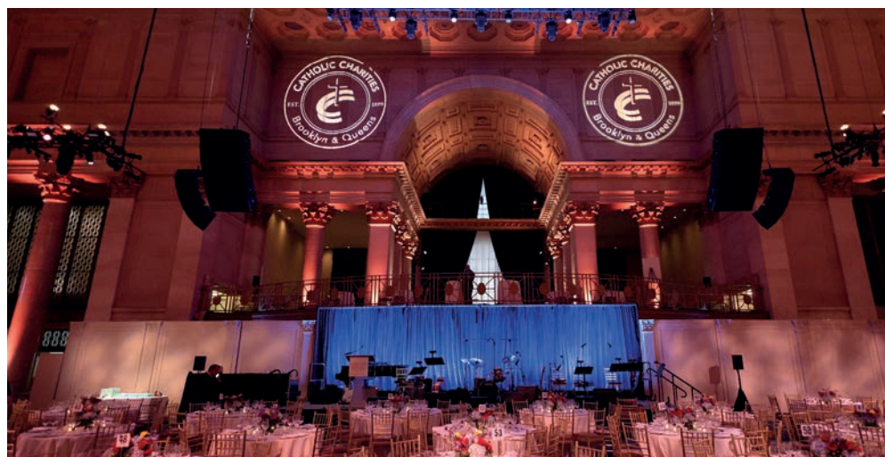
A look at the setup for the dinner at the breathtaking Cipriani Wall Street.