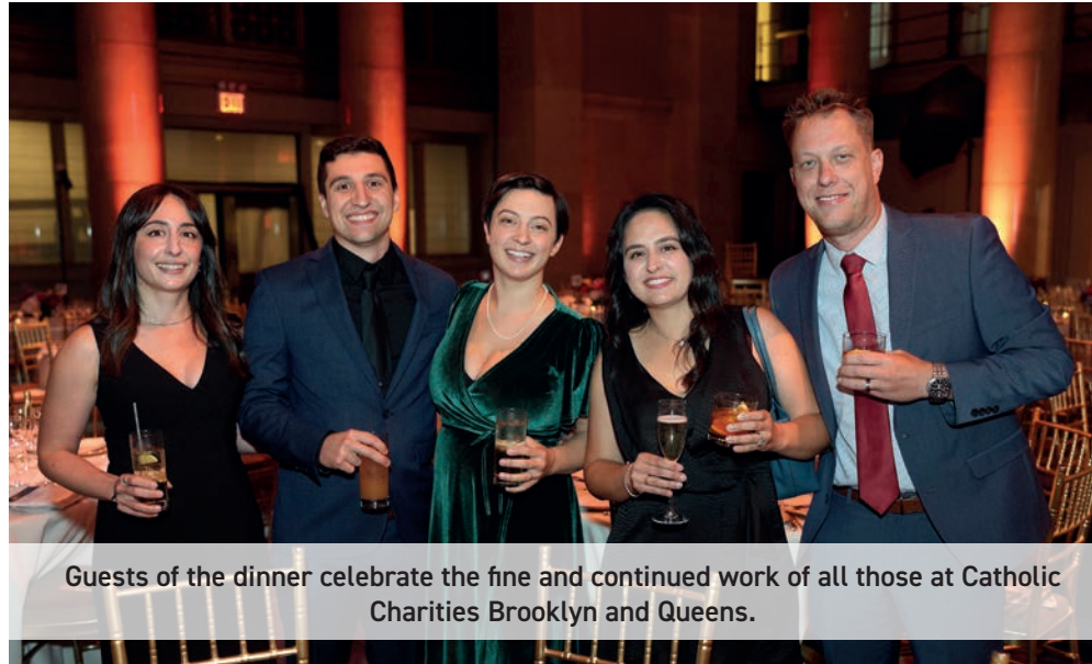
Guests of the dinner celebrate the fine and continued work of all those at Catholic Charities Brooklyn and Queens.