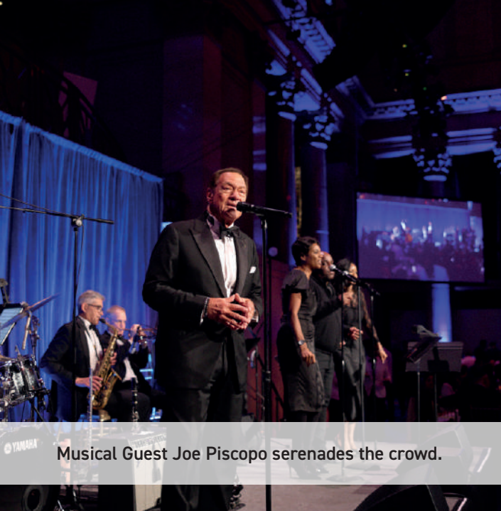
Musical Guest Joe Piscopo serenades the crowd.