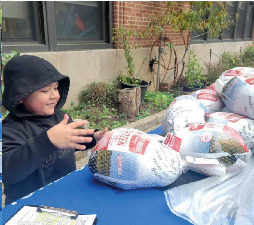
Our Early Childhood Development Center distributed 400 turkeys to our amazing early childhood families. In this photo: families from Sunset Park Head Start.