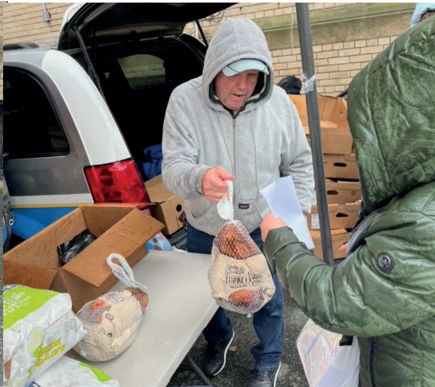
St. Mark's Roman Catholic Church's Food Pantry in Brooklyn provided over 90 families with turkeys, chickens, fresh fruits, eggs, and plenty of non-perishables.