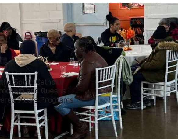
the Spirit Catholic Brooklyn and Queens Nourished Meals Programs