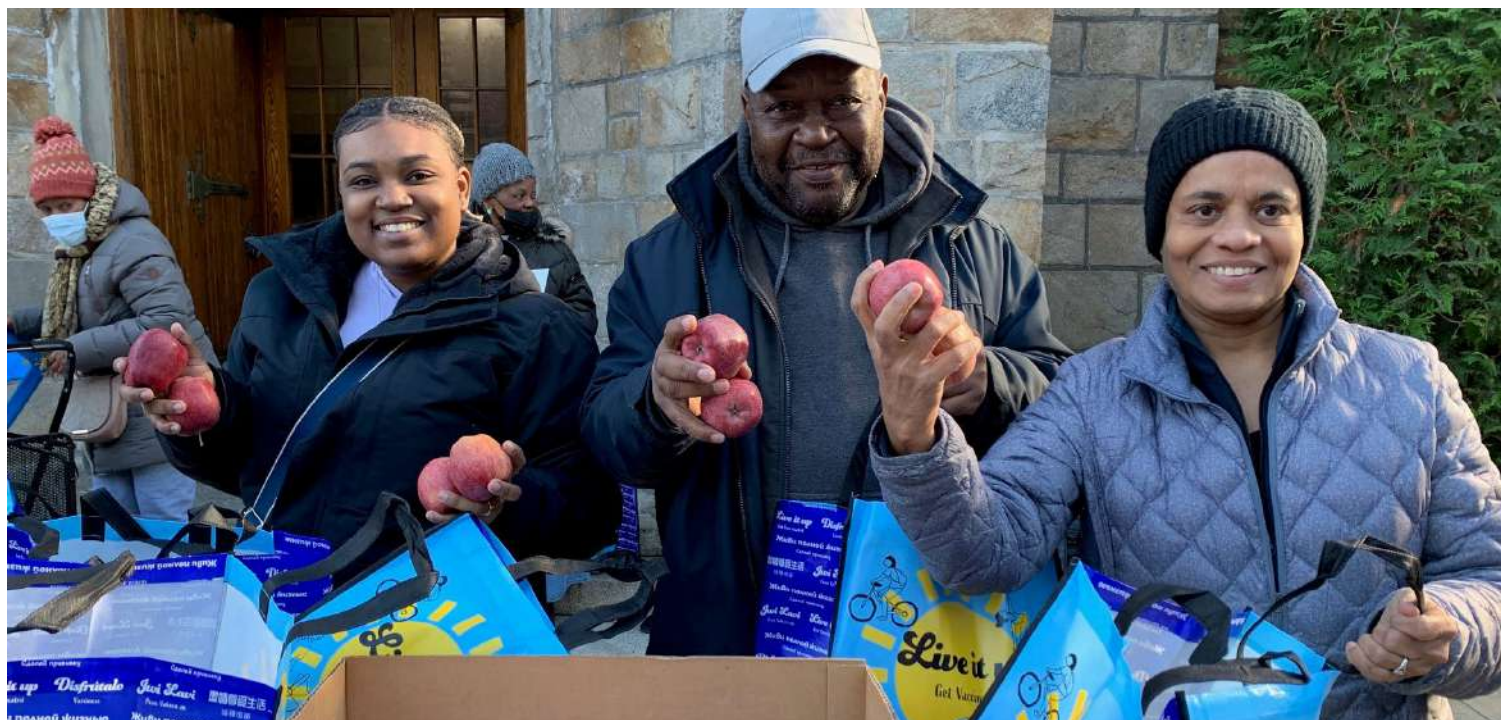
Volunteers prepare bags with turkeys and fixings at Holy Innocents RC Church in Brooklyn, during a turkey distribution organized by Catholic Charities Brooklyn and Queens on Tuesday, November 14, 2023.

Annual Thanksgiving Turkey Giveaway Feeds 3000 Families