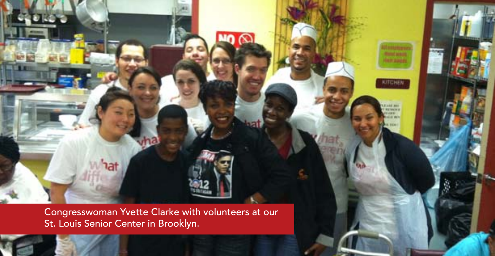
Congresswoman Yvette Clarke with volunteers at our St. Louis Senior Center in Brooklyn.