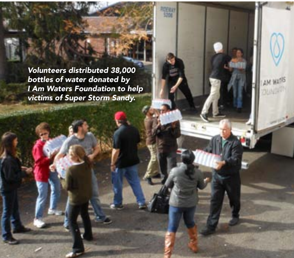
Volunteers distributed 38,000 bottles of water donated by I Am Waters Foundation to help victims of Super Storm Sandy.

During the first few weeks following Super Storm Sandy, over 1,200 volunteers provided 35,000 hours of service to assist those affected.